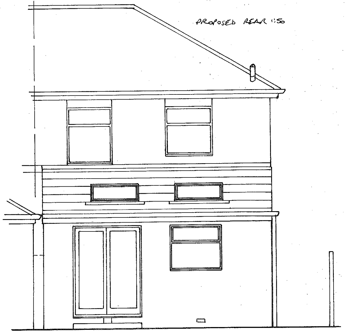
PROPOSED REAR 1:50

PROPOSED EXTENSION TO 59 REDBERRY WAY, S. SHIELDS FOR MR. SCOTT DRG NO 1