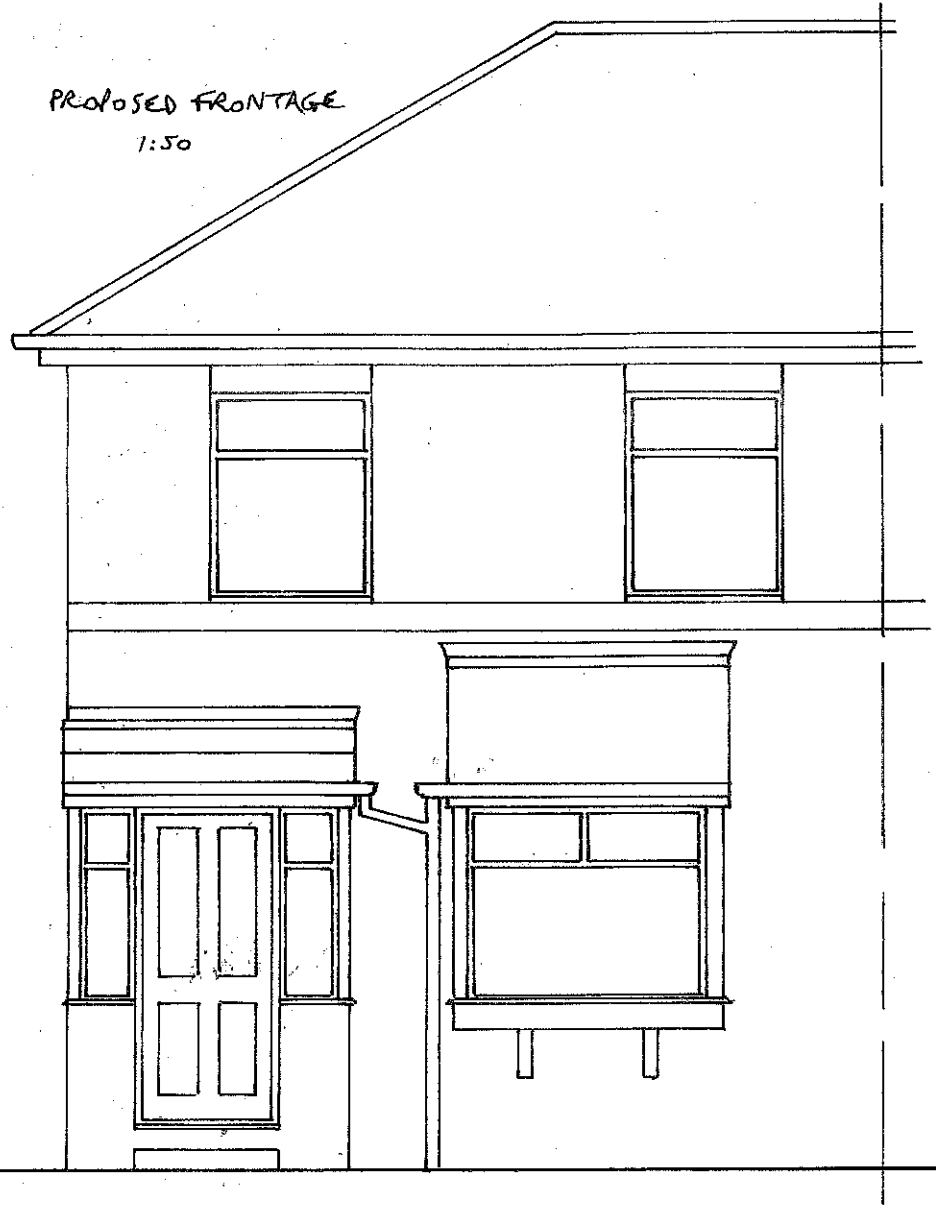
PROPOSED FRONTAGE 1:50

ROOF TILE, RED BRICK, WHITE UPVC FRAMING, ETC. TO MATCH EXISTING AS CLOSELY AS POSSIBLE.